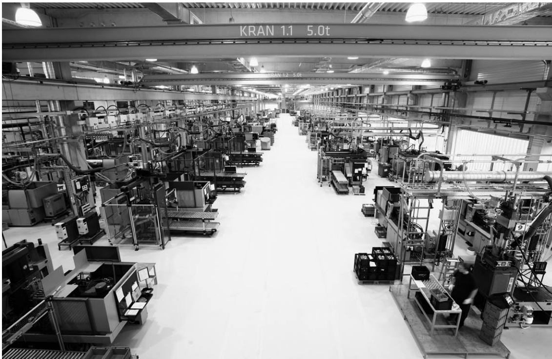
Tidied up: The 150 metre long production and processing hall

[JF] The new injection moulding factory in Rottenburg-Ergenzingen has now been in operation for nine months. Before this, the division was located in Nufringen, where there was no longer space for expansion. The new, ground-level factory excels with its transparency, short distances and energy efficiency.