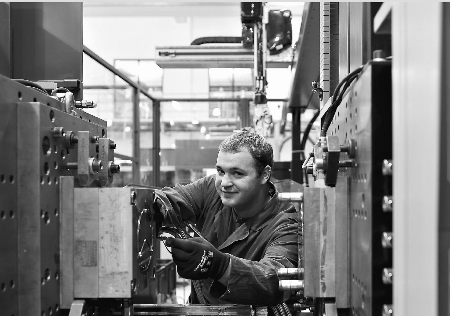
Theme: Manufacturing in the new injection moulding factory Ergenzingen